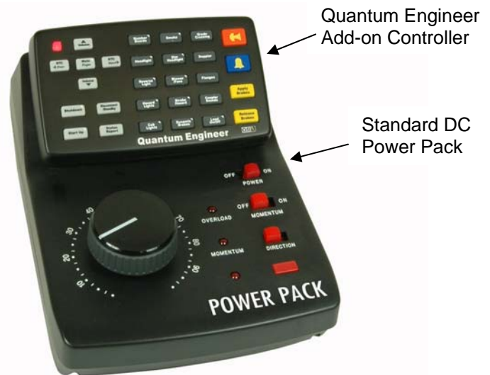
Quantum Engineer Shown Attached to Standard DC Power Pack Figure 2